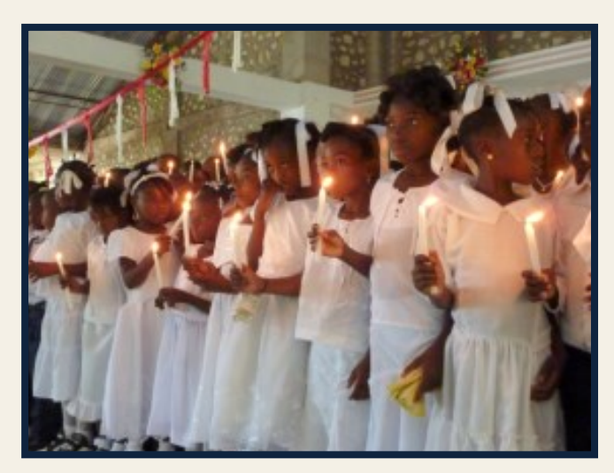
St. Joseph Catholic Church Medor, Haiti