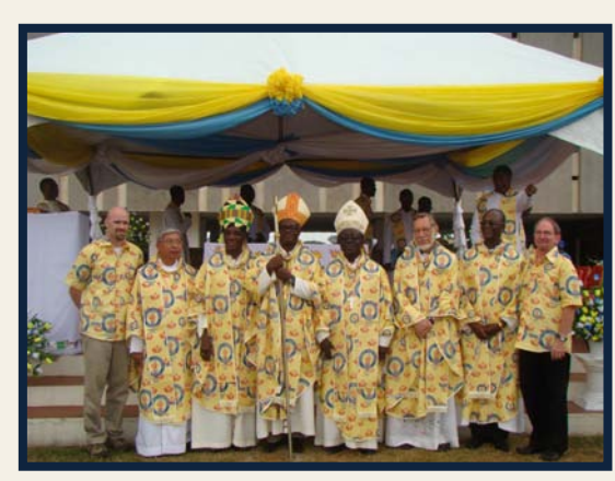
Catholic Charismatic Renewal Kumasi, Ghana