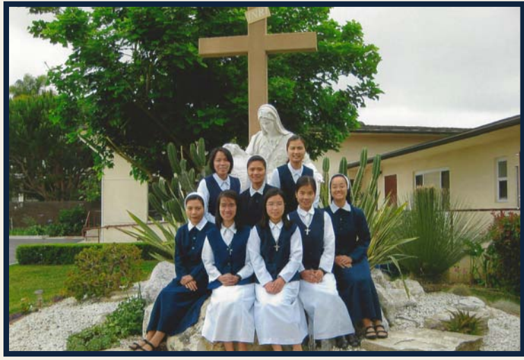
Lovers of the Holy Cross of Los Angeles Gardena, California, USA