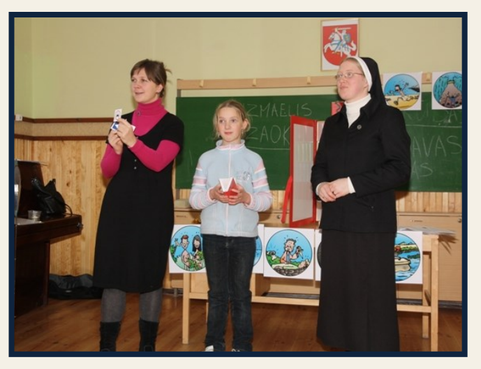
Panevezys Diocese Youth Center Panevezys, Lithuania