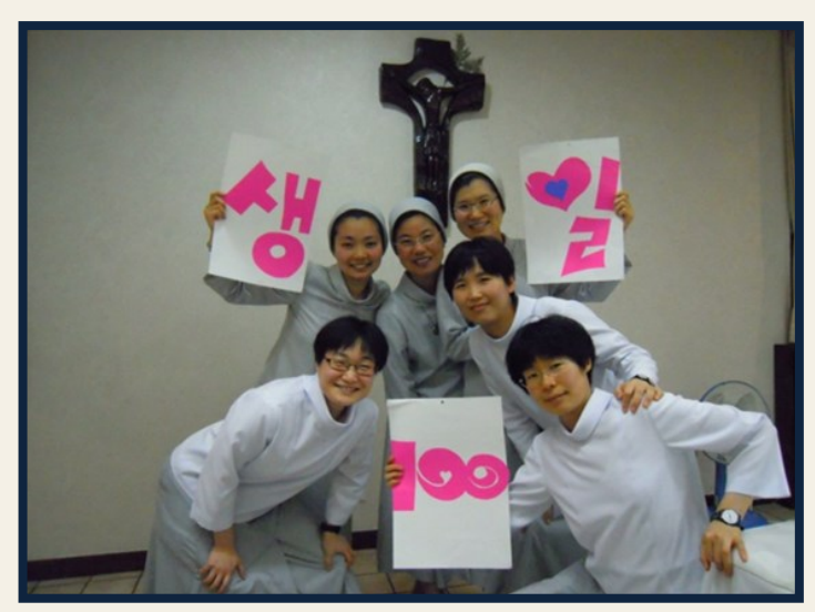
Sisters of Charity of Seton Hill Kwang'ju, South Korea