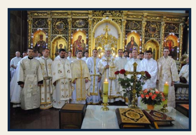
Institute of the Incarnate Word Ivano-Frankivski, Ukraine