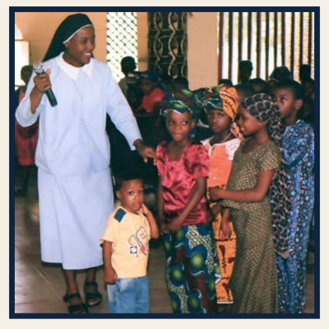
Parish Visitors of Mary Immaculate Sisters Okigwe, Nigeria