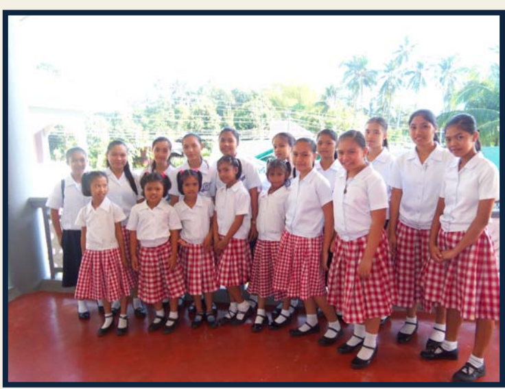
Ursuline Sisters of Somasca, Casa Cittadini Girls' Home Negros Oriental, Philippines