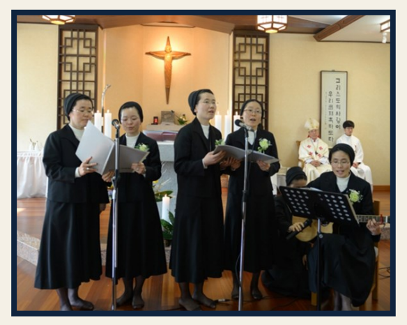
Sisters of Charity of Seton Hill Kwang'ju, South Korea

Evangelization is the foundation of the Catholic faith, whether by bringing His teachings to those who do not know Christ, or calling out to those who have turned away from the Church to return to the faith community. There are many ways to evangelize—through prison ministries where dedicated chaplains teach the incarcerated His love and the peace found in Him, through radio programs where the rosary is recited or the Mass is said which bring joy and unity to those who are separated by distance or are unable to attend in person yet still thirst to hear the Word, and through a multitude of other methods and media. The Koch Foundation supports evangelization of the Catholic faith through pastoral ministries, Catholic newsletters, and radio stations.