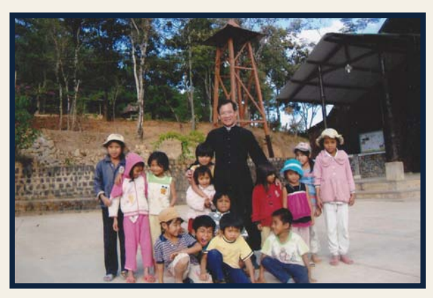
K'Ren Catholic Parish Da Lat, Lam Dong, Vietnam