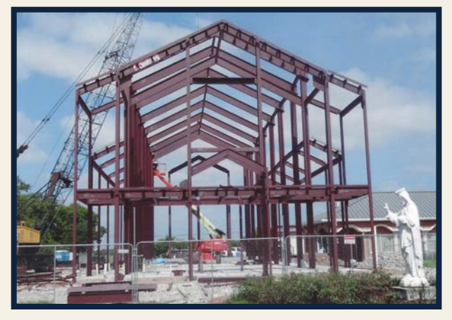
Vietnamese Dominican Sisters, Mary Immaculate Province Houston, Texas, USA

Many throughout the world are suffering from persecution because of their faith, have been affected by natural disasters, or live precariously in areas suffering from political unrest. The Beatitudes tell us that Christ asks us to follow Him but the path is not easy. We face so many challenges in life: poverty, distress, humiliation, the struggle for justice, and persecutions for His sake, but we know our reward will be great. The Koch Foundation supports communities who have suffered both physically and spirituality as they rebuild their faith in challenging situations.