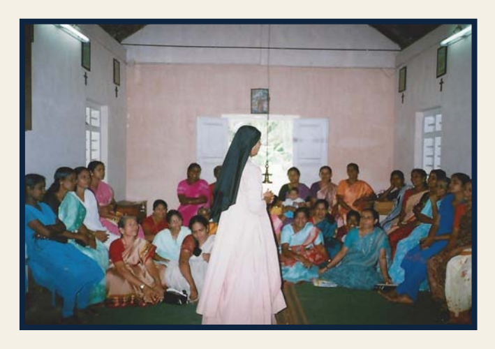
St. Thomas Malankara Catholic Church Kerala, India