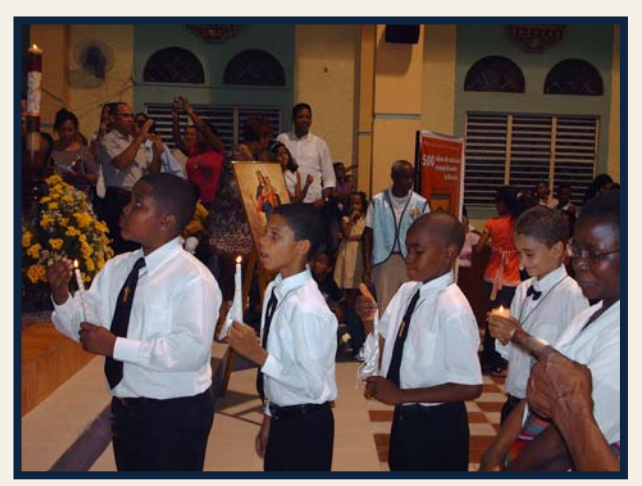
Centro Socio Educativo Madre Asuncion Santo Domingo, Dominican Republic