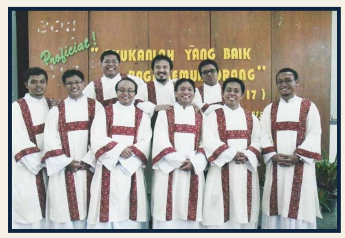
St. Augustine Propaedeutic Seminary Purwokerto, Indonesia