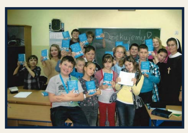
St. Felix of Cantalice Sisters, Mother of God Queen of Poland Province Warsaw, Poland