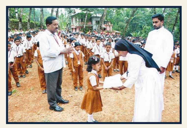
Pathanamthitta Diocese Kerala, India