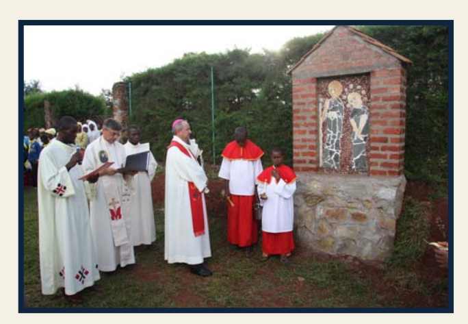
Marian Fathers, Shrine of Divine Mercy Ayos, Cameroon