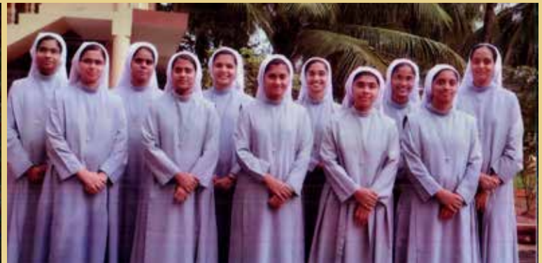
Congregation of the Holy Family, Palghat, India