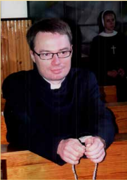
Society of Jesus, Warsaw, Poland

Much like the angels in Heaven, men and women religious dedicate their lives serving the Lord and bringing the message of the Gospel to the four corners of the earth, often facing the most challenging of situations to strengthen us in our faith and devotion to God.