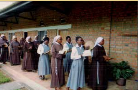
Poor Clares, Mbarara, Uganda

The Koch Foundation funds the Preparation of Evangelists, formation programs and religious activities that prepare individuals and groups to proclaim the Good News of salvation through the Catholic faith.