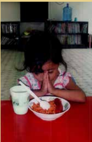
Holy Angels School, Colombo, Sri Lanka