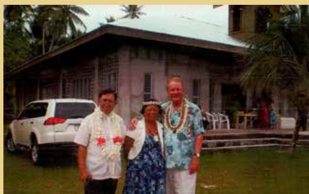
Marshall Islands Diocese, Marshall Islands

The Koch Foundation provides support for the construction, repair and renovation of religious structures in the United States, its territories and Haiti.