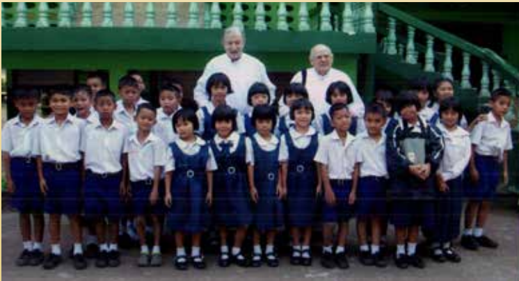
Sarnelli House, Chang, Mai, Thailand