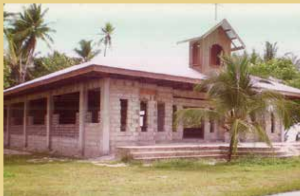
St. Francis Xavier Church, Marshall Islands