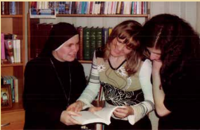
Servants of the Lord and the Virgin of Matara, Novosibirsk, Russia