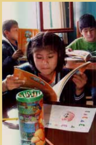
Daughters of Charity, Cochabamb, Bolivia

Pope Francis has called upon all Catholics to spread the faith and carry the Word of God to those who are unchurched as well as those who are alienated from the Church. As we show our relationship with Christ by living out our faith we are able to help bring others to know Him. Using the various means of communication available to us in this era of social media, we can proclaim the Gospel to all people, working as His angels on earth to proclaim the Word.