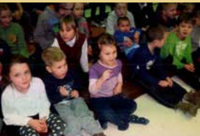
Sisters of St. Felix of Cantalice, Przemysl, Poland

Often Catholic Schools are the major force of evangelization in many communities, accepting children from different backgrounds and different faiths while providing a strong academic program equally to all children.