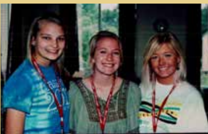
Archdiocese of St. Louis, St. Louis, MO